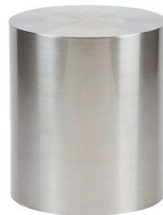
stainless steel drum